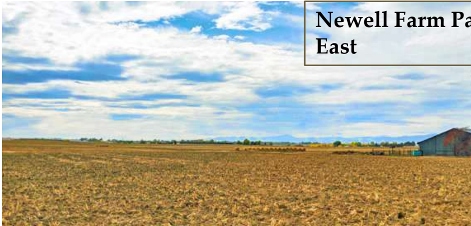
Newell Farm Park from the East